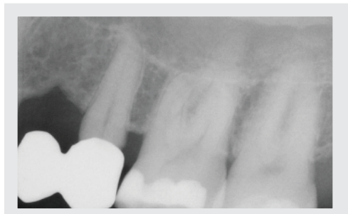
Figure 1—Preop radiograph

restoration with fewer remakes, fewer problems, and a "wow" factor that leaves patients with the feeling that dentistry is actually a science instead of someone just drilling on their teeth.