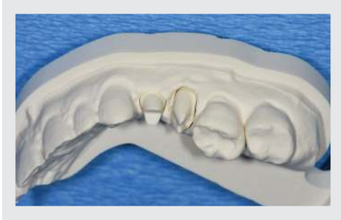
Figure 4—Milled model showing tooth prep No. 12 and implant abutment analog No. 13